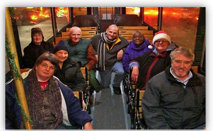
Holly Jolly Holiday Trolley Tour in Savannah